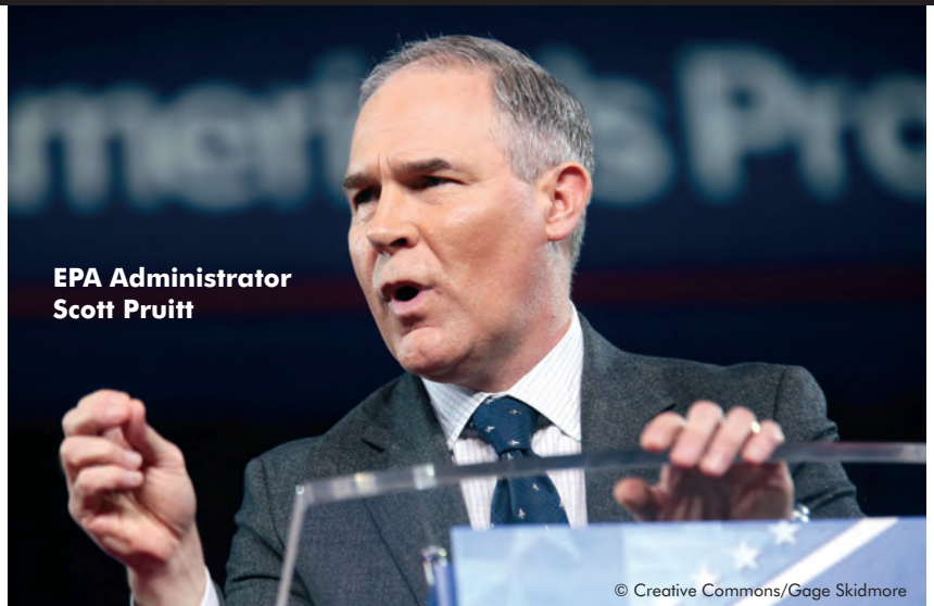
EPA Administrator Scott Pruitt

The litigation follows a 2008 petition filed by 13 organizations, including Beyond Pesticides, a lawsuit in 2014, and an EPA agreement in 2015 to evaluate nanotech pesticides.